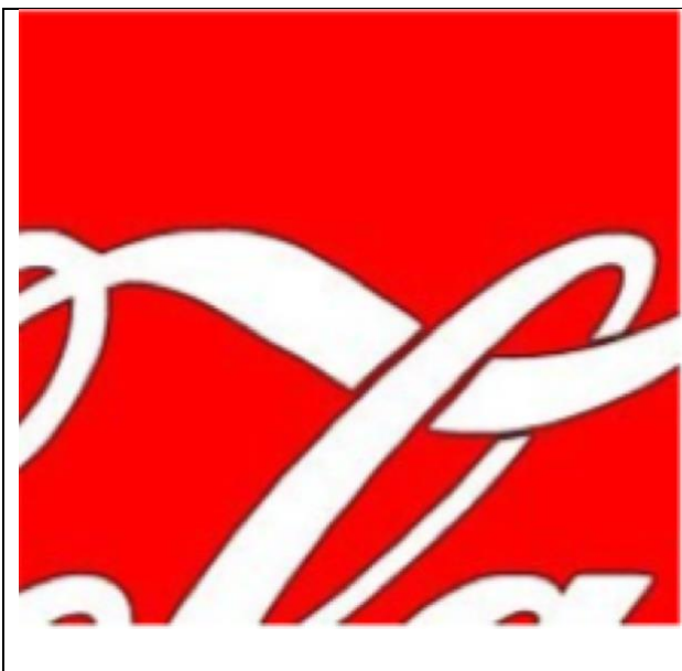
10. Coca Cola