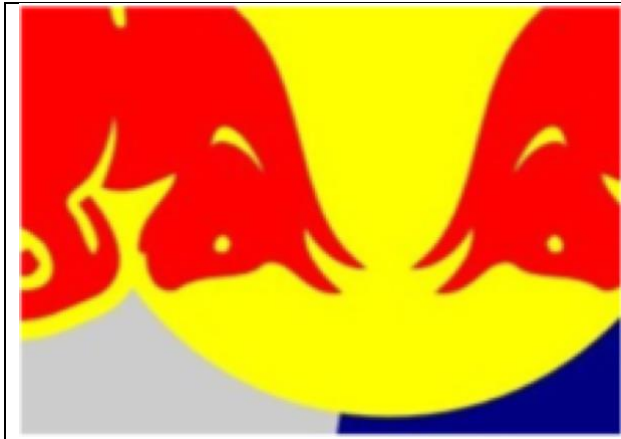
4. Red Bull