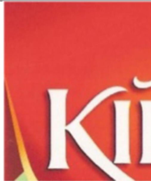
5. Mr Kipling