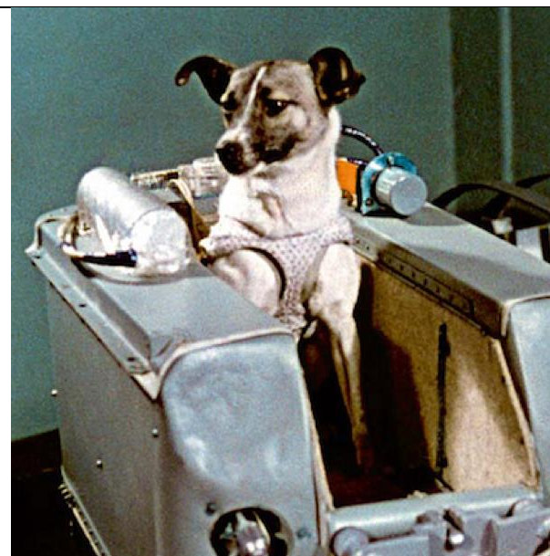
9. Laika (the first dog in space)