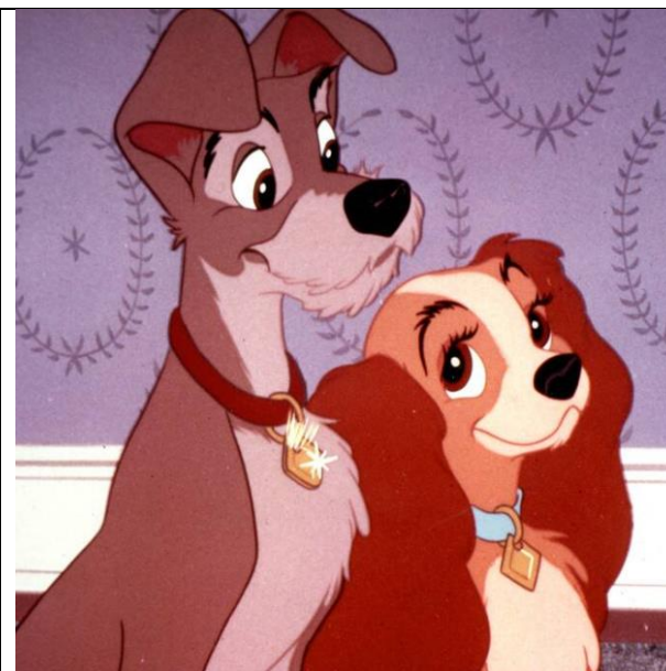
6. Lady and the Tramp