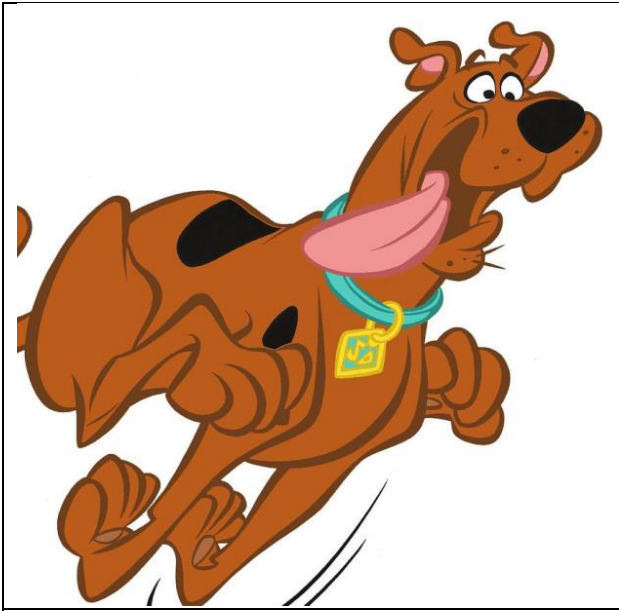
10. Scooby Doo