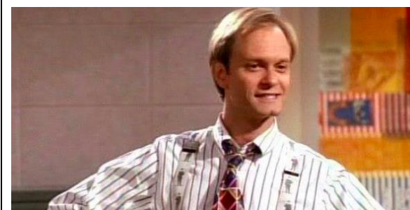
12. Niles Crane