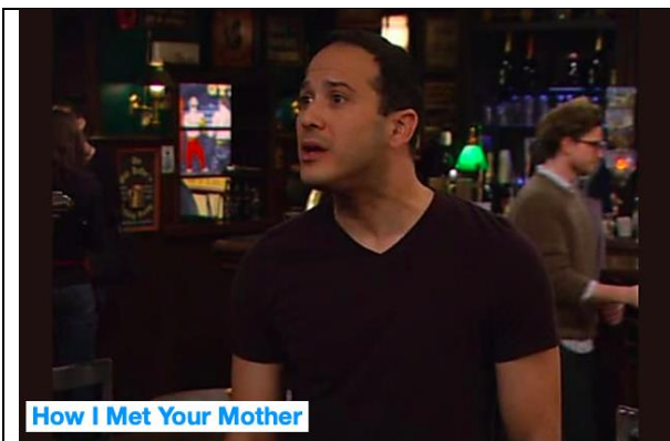
How I Met Your Mother