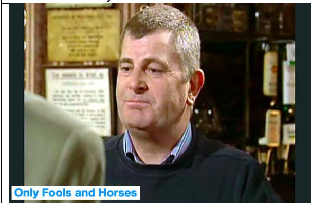
Only Fools and Horses