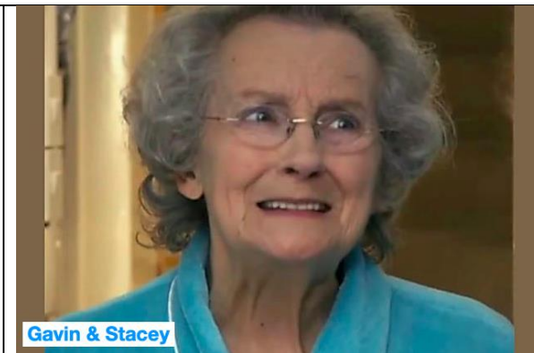
Gavin & Stacey