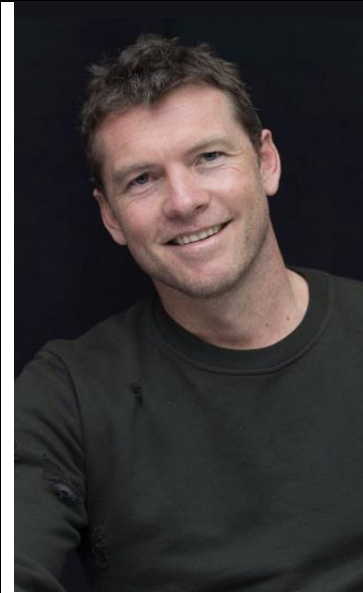
9. Sam Worthington