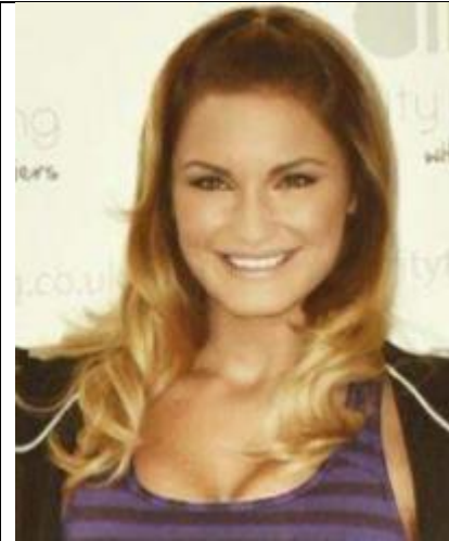
3. Sam Faiers