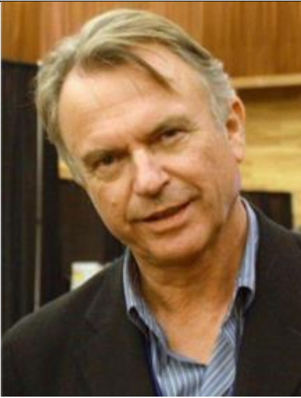
1. Sam Neill