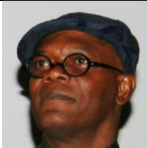
2. Samuel L. Jackson