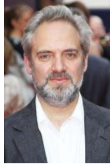
6. Sam Mendes