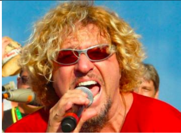
11. Sammy Hagar