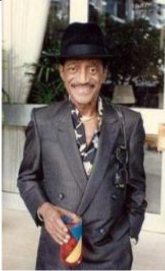
4. Sammy Davis Jr.