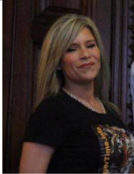
5. Samantha Fox